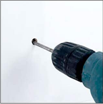
1. Pre-drill - Measure distance and drill holes on wall