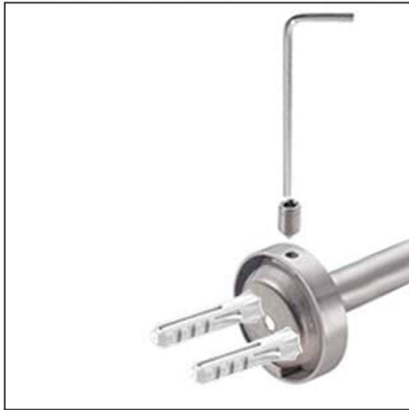
5. Tighten the screws and everything's done