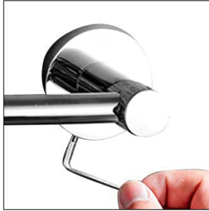
3. Use the L tool to unscrew the plate