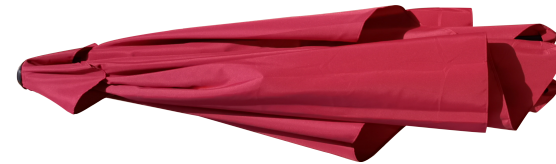
Umbrella Canopy x 1