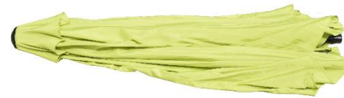
Umbrella Canopy x 1