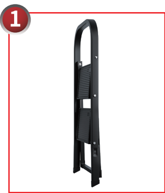
Ladder storage status.