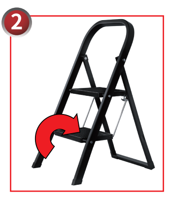
Push down the bottom tread until it is fully unfolded