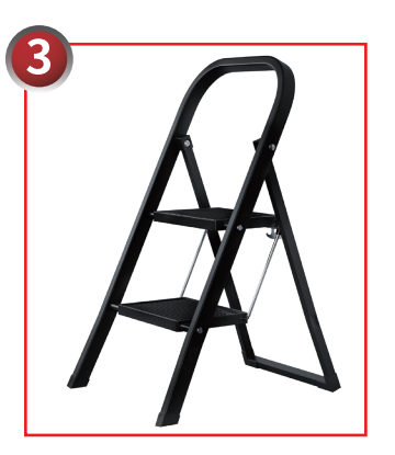
Fully opened, secure automatic clip