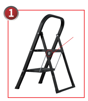
To unfasten, just lift the flap and pull out