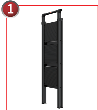
Ladder storage status.