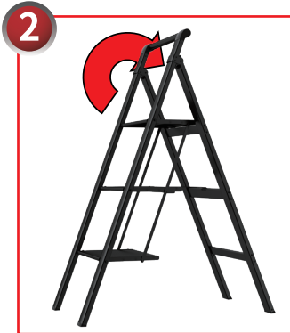
Push down on the top tread until the ladder unfolds, continue to push the tread until the ladder is fully open.