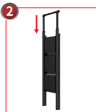
Push up on the top tread to allow the ladder to retract and continue to push the tread until the ladder is fully retracted.