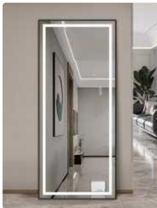
2.Lean to the Wall