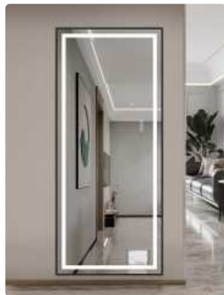
3.Hang on the Wall