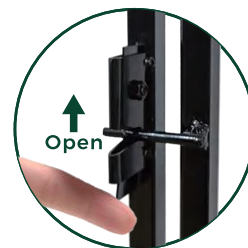
Gravity Automatic Door Latch Device