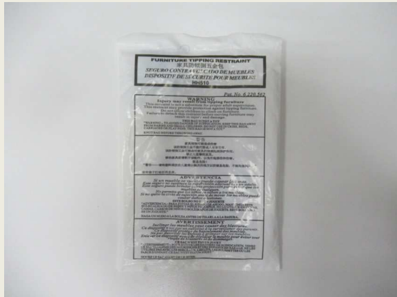
TIPPING RESTRAINT KITS