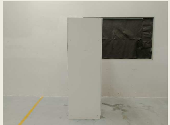
SIDE 2 VIEW (A)