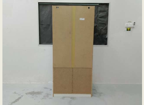
REAR VIEW (B)