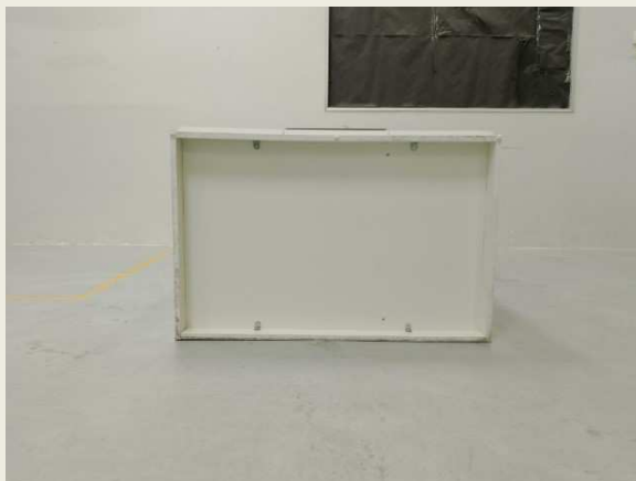
BOTTOM VIEW (A)