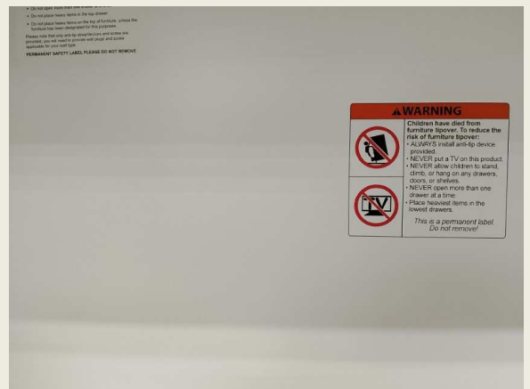
WARNING LABEL (B)