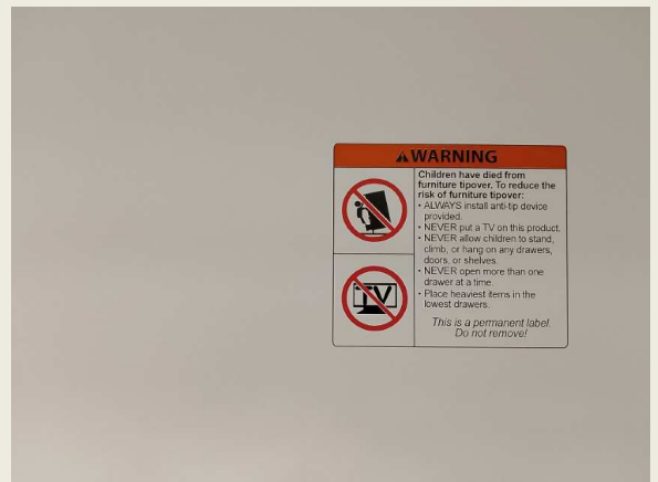
WARNING LABEL (A)