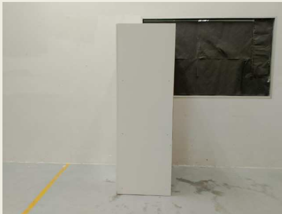
SIDE 1 VIEW (A)