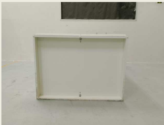
BOTTOM VIEW (B)