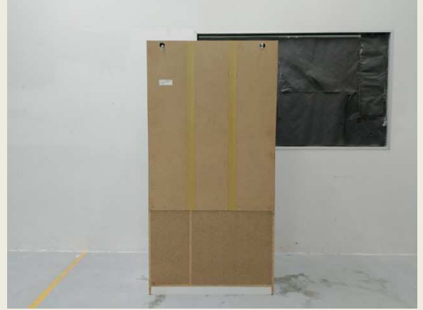
REAR VIEW (A)