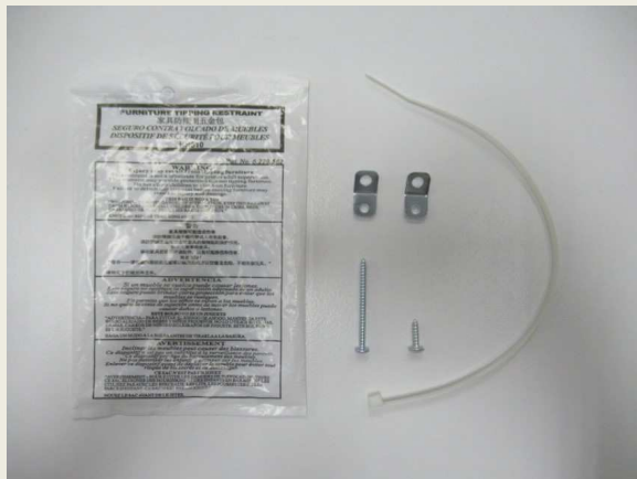
TIPPING RESTRAINT KITS