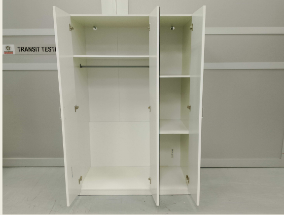
FRONT VIEW (A)