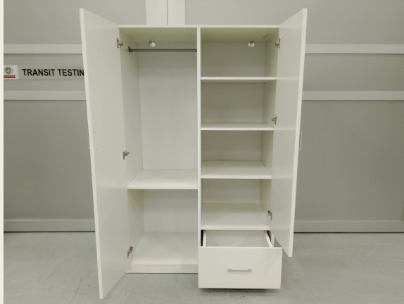
FRONT VIEW (B)