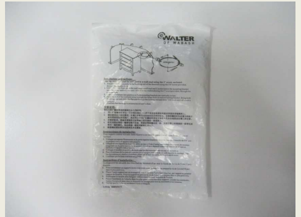
TIPPING RESTRAINT KITS