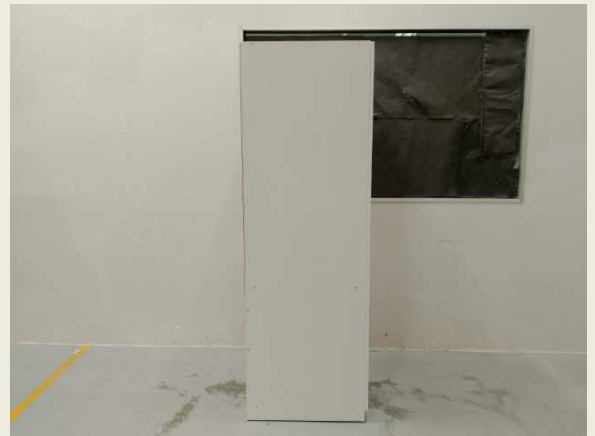
SIDE 2 VIEW (B)