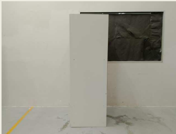
SIDE 1 VIEW (B)