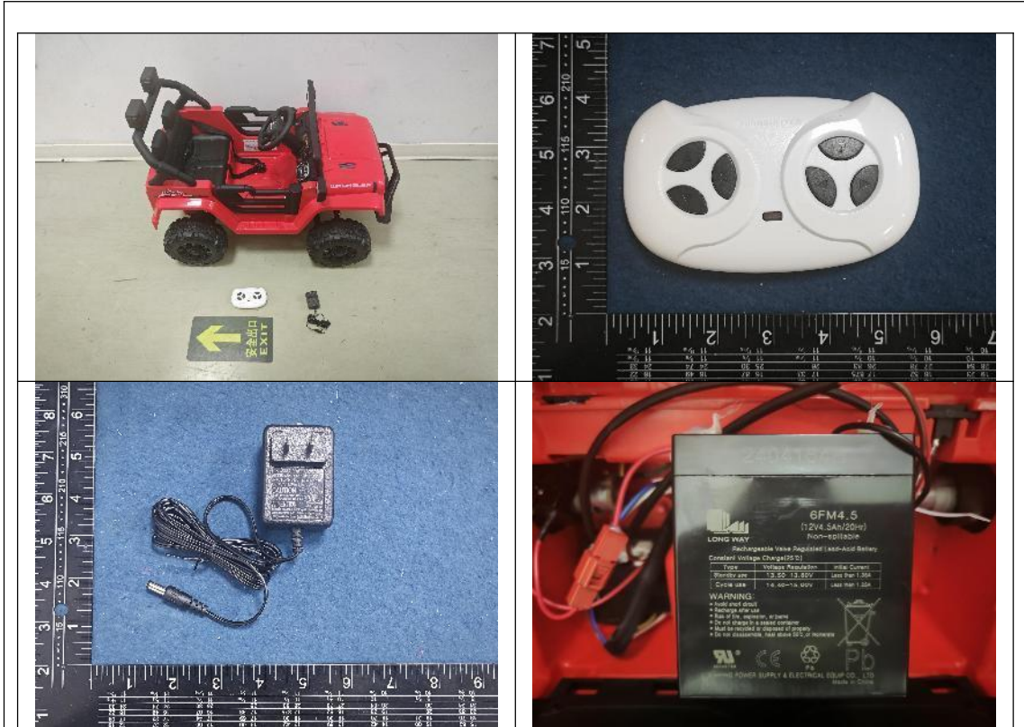
Figure 1-main EUT