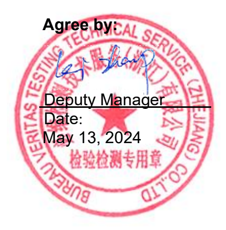
Supervisor Date: May 13, 2024

Bureau Veritas Testing Technical Service (Zhejiang) Co.,Ltd