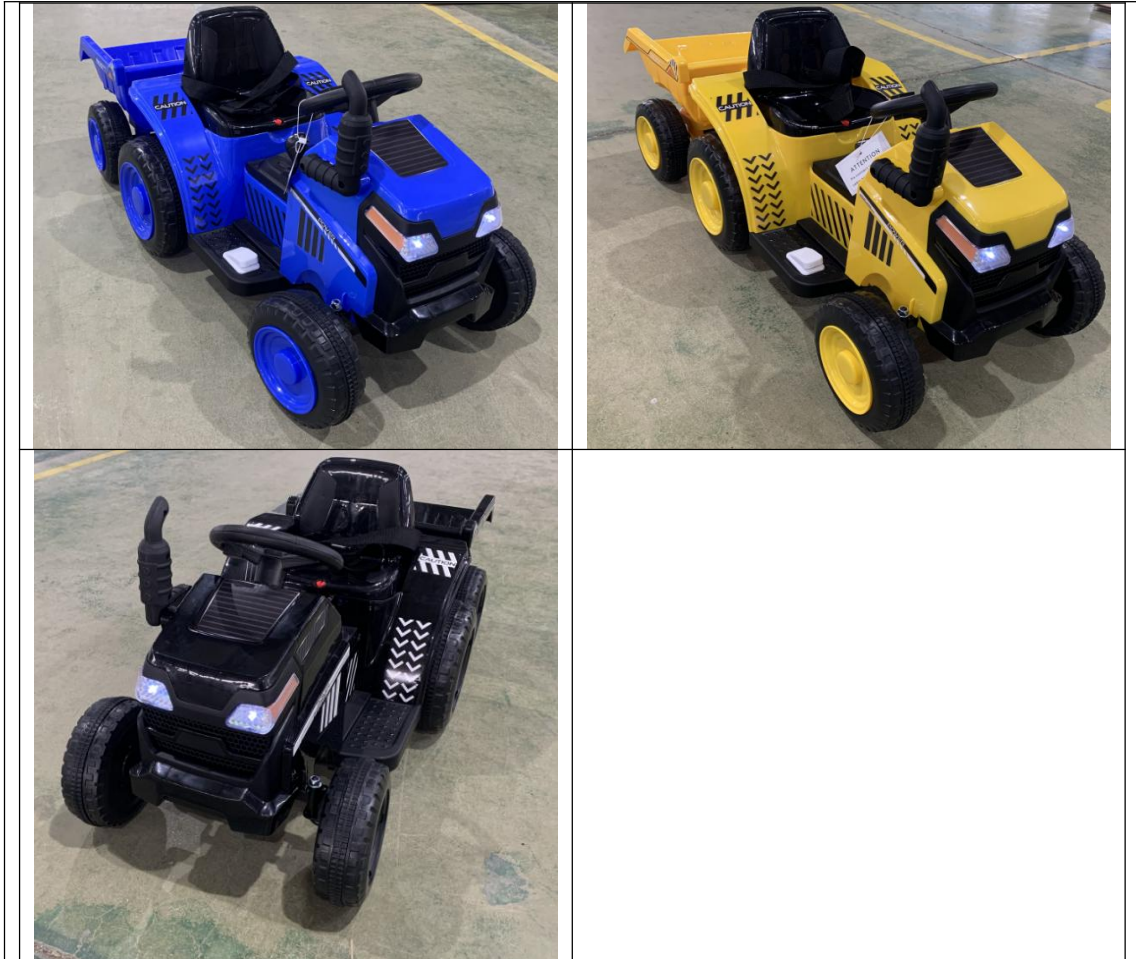
Figure 1-main EUT