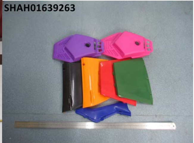
The Samples Were Submitted By The Client, Only For Reference.