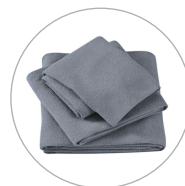
soft dry cloth