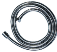
Stainless Steel coated flexible hose