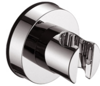
Suction cup fixed base